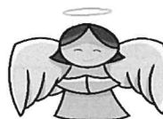
Justice and Charity

The Theresians are seeking additional bakers for the Big Winter Bake Sale and Basket Raffle, December 16th and 17th. The sale will take place before and after each of the Masses. Please bring Sale items to the Kitchen starting at 3:00 p.m. Saturday, December 16th. Raffle tickets are $1.00 each or 6 for $5.00 (you choose the basket you'd like to try to win). Individual baked goods will be priced. Cookies will be $6.00 per pound. Pick up gloves and a box and take home an assortment of our bakers' finest Holiday Treats. It is always with the help of our Parish Volunteer Bakers in addition to the Theresian Bakers that we can offer the GREAT VARIETY of cookies and baked goods at the Big Winter Bake Sale and Basket Raffle.